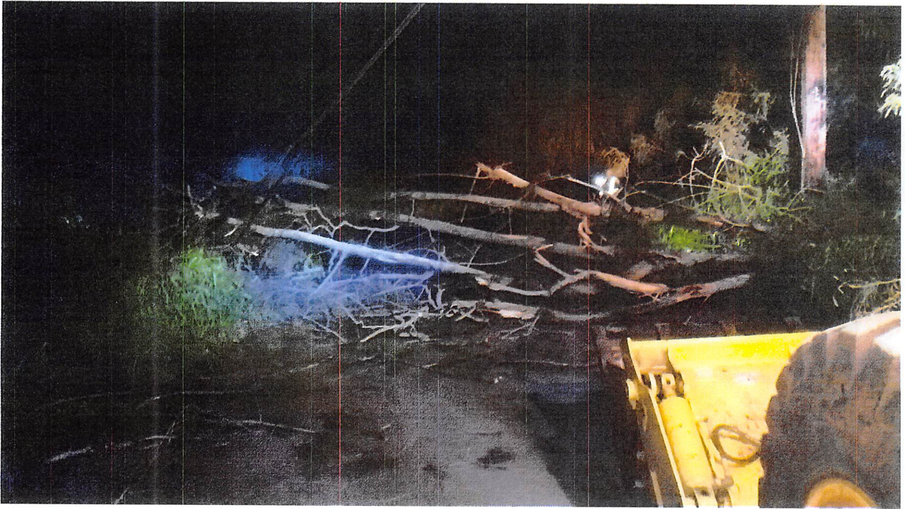
The Department of Public Works responds to fallen trees on Piiholo Road on Sunday, February 25, 2018.

RECEIVED AT Council MEETING ON 2/27/18 Chair White