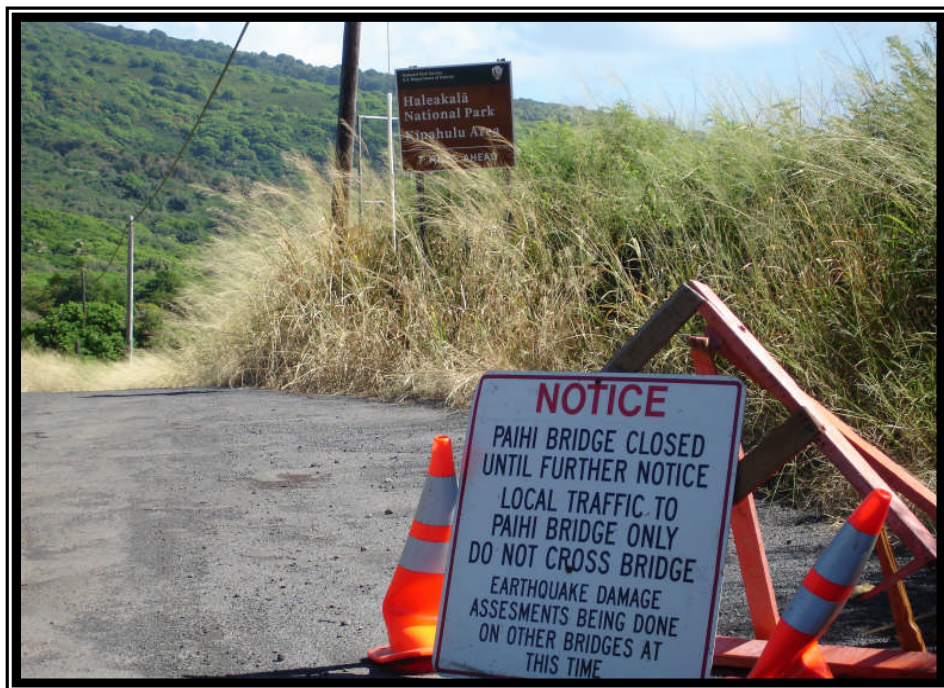
Warning sign posted after 2006 earthquake, Kīpahulu.

Property owners, businesses, service providers, and government have a tendency to