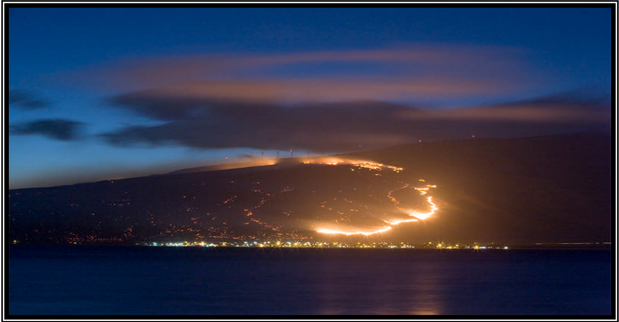
A wildfire burns across the pali, Mā`alaea.

M au i's pristine waters, lush mountainsides, dry brushland, and dormant volcano offer an awe-inspiring variety of landscapes to explore. The different extremes in climate and terrain can come with a price: the potential for numerous natural hazards that could affect any part of the island. Chronic hazards, such as coastal erosion, flooding, and vog (volcanic smog), may persist or recur over long periods of time. Tsunamis, hurricanes, wildfires, and earthquakes vary in frequency and intensity and are difficult to predict. With the impacts of climate change superimposed on Hawai`i's existing risk from these hazards, communities may be exposed to more severe and frequent hazards, increasing risk; and potentially affecting our economy and eroding the quality of life.