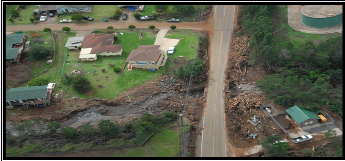
Aerial view of the destruction caused by a Kona storm, Kula.

Property damage resulting from natural hazards has become exceedingly costly for both the disaster victims and the American taxpayer. According to the Maui County Multi-Hazard Mitigation Plan (HMP), from 1989 to 1993, the average annual loss from natural disasters was $3.3 billion nationally. Over 6,000 people have been killed and 50,000 injured from natural disasters in the past 25 years (FEMA, 1998). Nationally, extreme weather caused approximately $23.9 billion in combined property and crop damages in 2011, more than double the $9.9 billion in 2010. Property damages were estimated at $20.9 billion, almost triple the 2010 total of $7 billion and 2009 total of $6.8 billion. As in 2010, flooding was a major culprit, accounting for more than $9 billion in losses. Weather-related deaths also more than doubled in 2011, reaching 1,091 victims, up from 490 in 2010. According to the National Weather Service, this number is well above the 10-year average (2002-2011) of 641.