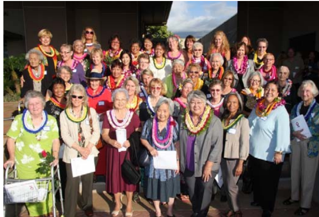
2010 Women's History Month Honorees

The Maui County Committee on the Status of Women (CSW) is a seven-member volunteer group of mayoral appointees that advocates for social justice, educates women on their rights, educates women to vote, engages in political processes, gathers information on women's issues, promotes women's equality, and serves as a resource for women through programming, public education, and citizen participation.