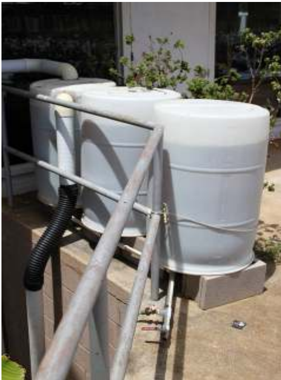
Water barrels are used to capture rain water and AC condensate for irrigation at the Hokama's Garden

A solar powered irrigation system that utilizes AC condensate and rainwater catchment is employed. Zero potable water is used. Water features are re-filled using rainwater catchment and AC condensate overflow.