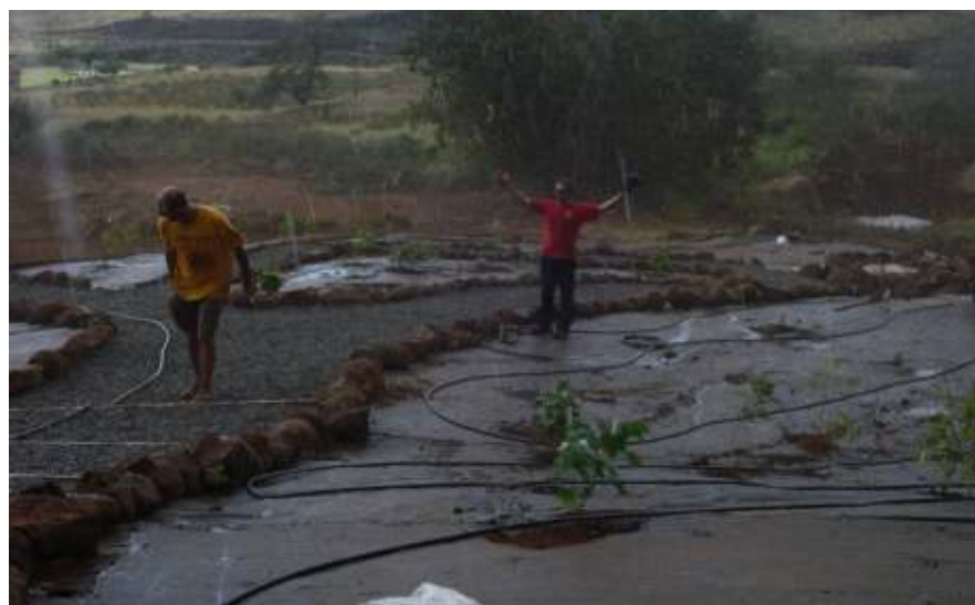
After a hard day's work, the garden is blessed with rain.