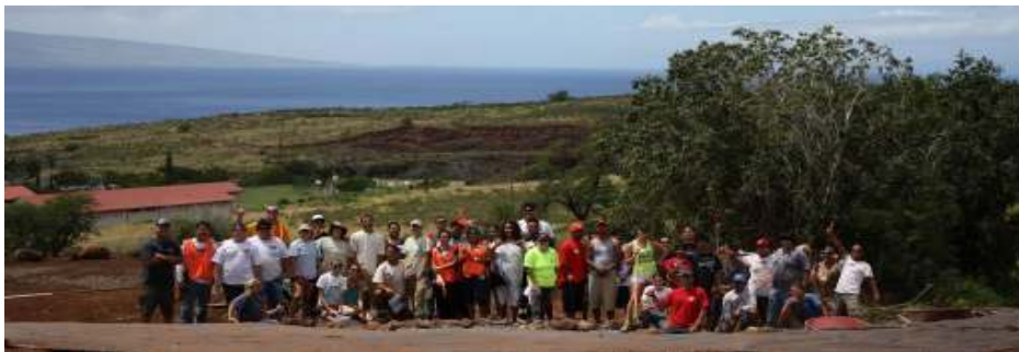
Lahainaluna wins the award for volunteer biggest turnout.

Maui County Department of Water Supply, Community Work Day, and Lahainaluna High School is spearheading a project to revitalize the agriculture department at the high school. DWS personnel trained Lahainaluna high school students to develop irrigation systems based on sound irrigation principals. The farm is a total of about 5 acres consisting of native plant gardens and a fruit tree orchard. The native garden was designed to provide seed stock to an assortment of community groups who propagate native plants for the West Maui Region. Future projects include re-circulating agriculture, taro loi, and native plant reforestation on over 600 acres of Lahainaluna High School Department of Education land.