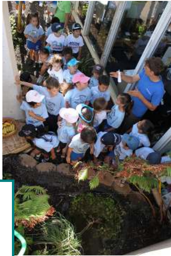
The Hokamas garden being toured by Saint Anthony Grade School Children

The theme of the demonstration garden at the Hokamas building is "ahupua'a." The different garden zones are integrated and interact, representing native watershed while blending in technology behind the scenes. This is the main theme that some call "contrived nature." Taro aquaponics represents traditional lo'i agriculture with modern techniques, promoting technology and science. Native plants were selected for their aesthetics as well as historical use in traditional craft making and potential for modern diversified agriculture on Maui. The garden showcases a selection of plants from all the zones from mauka to makai.