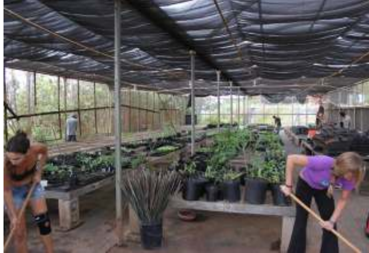
Volunteers cleaning up the greenhouse

The Community Work Day (CWD) and Bioponic Phytoceuticals Community Greenhouse was originally designed and used as a tomato hydroponics facility. For several years it was not used until a collaboration of the DWS, CWD, and Bioponic Phytoceuticals developed it into a functioning hydroponics facility. Native and edible plants are grown from seed in the greenhouse to utilize in various gardens. Plant material was gathered from nurseries, farms, personal donations, and the wild.