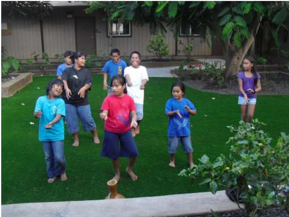
The keiki enjoy their hula lessons on the beautiful SynLawn in the courtyard at Ka Hale A Ke Ola .