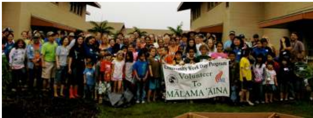
The crew came out and worked very hard to build the garden classroom for Pomaikai

Pomaikai Green Dream Website: http://pomaikai2.k12.hi.us/~greendream/green_dream/welcome.html