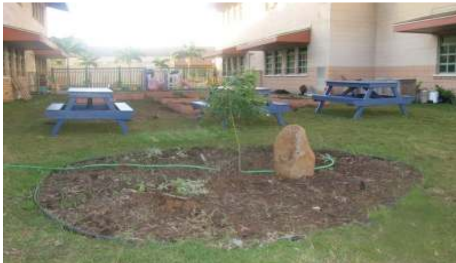
The benches and garden are ready for students at Pomaikai Elementary